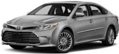
2013-2018 Toyota Avalon