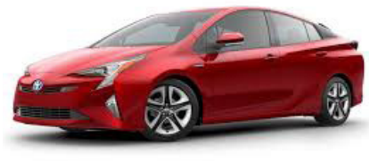
2004-2018 Toyota Prius

Toyota requires using the positive (+) battery connection located in the under hood fuse box on the driver side (figure 1) when jump starting the hybrid vehicles above.