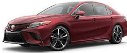
2008-2018 Toyota Camry